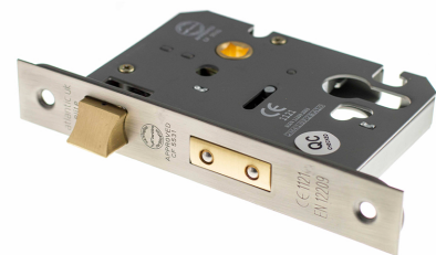
Product Finish Pictured: Matt Gun Metal (MBN)